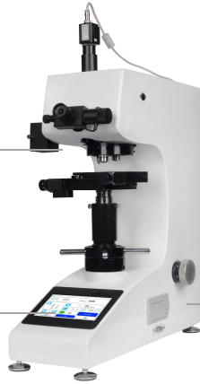
Touch Screen & Built-in Printer