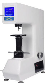
Integrated Cast Body ( No-welding)